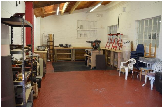
10 th October 2017 What a difference