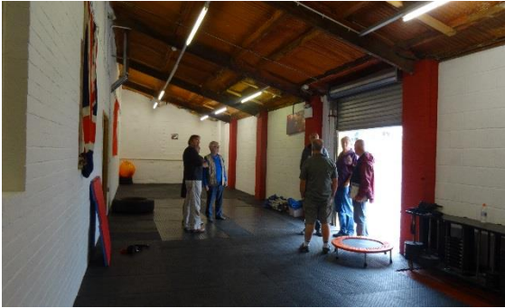
8 th August 2017 The start of the dream.