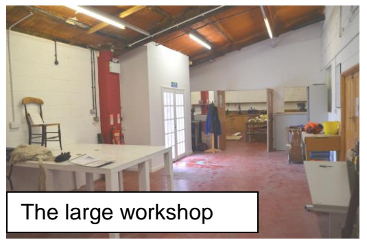
The large workshop